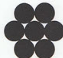
The Monster 7 X 3/4" X 16-Feet