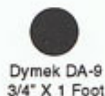
Dymek DA-9 3/4" X 1 Foot